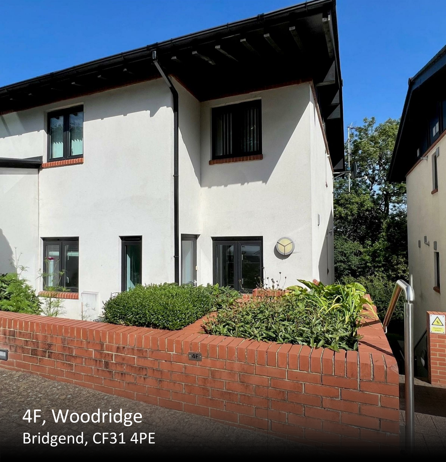
4F, Woodridge Bridgend, CF31 4PE